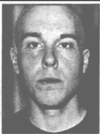
SPAULDING: Fugitive kept cartons of neo- Nazi propaganda.