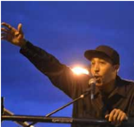
10/2012 Occupy The Hood organized over 700 of all races, faiths & ages,