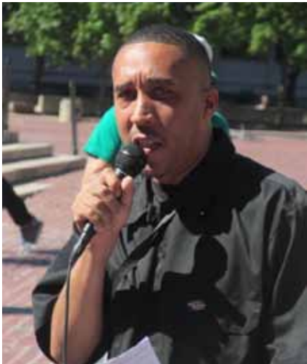
8/2013 Rally for Solutions organized over 100 people on City Hall Plaza