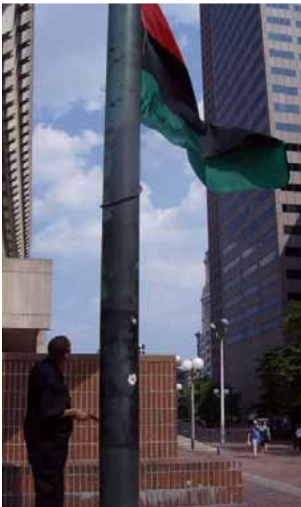
8/2009 Raising the Red, Black & Green Flag on City Hall Plaza