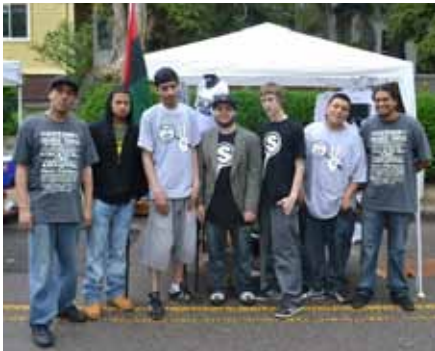
5/2011 At the Wake Up the Earth Festival with the young men (aged 17-28) from Scope Urban Apparel - organized “Wake Up the City” show raising $400 for Feed the Hood.