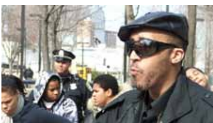
9/2009 Leading protest against police Brutality at BPD Headquarters