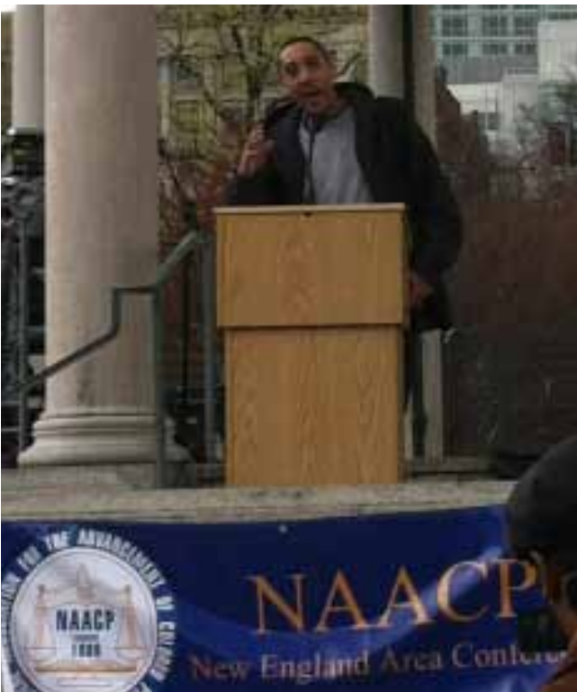
4/2012 - The Boston Commons “Rally For Justice” for Trayvon Martin. Crawford was one of the coalition members along with the New England Area Conference of the NAACP and more.